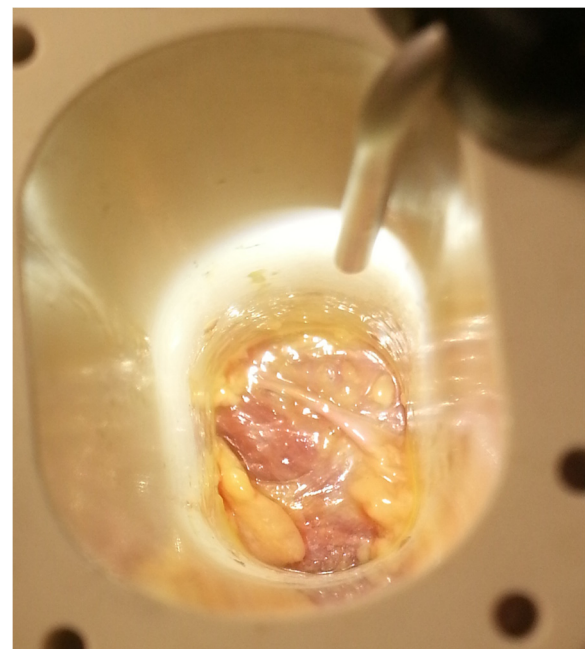
Figure 3 Direct psoas and nerve visualization.

roots are most commonly observed to the posterior. Two hand-held blades and an inner sleeve are used to retract the psoas muscle to the level of the disc an annulotomy is performed (Figure 5). Dissectomy and endplate preparation are then completed using standard instruments. Autogenous bone graft material is packed inside a PEEK implant, which is inserted into the disc space. Final anteroposterior and lateral images are taken, all instrumentation is removed, and the wound is closed in the standard fashion. The technique is indicated for use with supplemental fixation devices, which may be selected at the surgeon's discretion.