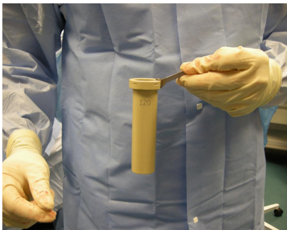
Figure 1 Fixed radiolucent tube allows for direct psoas visualization and improves fluoroscopic visibility.

With the patient in the lateral decubitus position, true anteroposterior and lateral fluoroscopic images are obtained. A 3-cm anteroposterior incision is made over the center of the disc space, and dissection is continued deep to the external oblique fascia. The muscle layers of the abdominal wall are longitudinally separated with blunt instruments to access the retroperitoneal space. The surgical corridor is then established using sequential blunt dilators inserted through the retroperitoneal space and onto the surface of the psoas muscle. Once correct retractor position is confirmed with fluoroscopy, a radiolucent tube (Figure 1) is inserted, the dilators are removed, and a lateral fluoroscopic image confirms correct positioning over the disc space (Figure 2). At this point in the procedure, the psoas muscle and surrounding nerves can be directly visualized (Figure 3). Dissection continues in the anteroposterior direction to the level of the disc (Figure 4). The nerve roots may be directly visible through the tube prior to and during dissection. Depending of the level treated, the sensory root may be observed traversing the surface of the muscle, while the motor