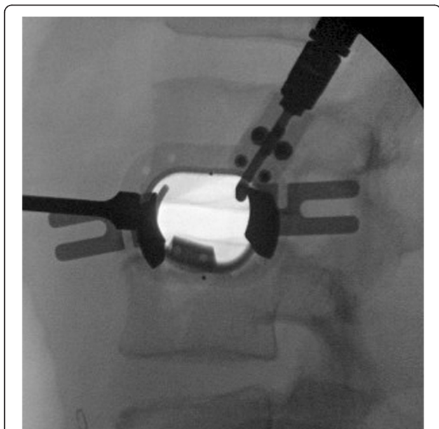
Figure 5 Lateral fluoroscopic image of fully-assembled DV-LIF retractor.

All complications, regardless of severity, were recorded into a pre-defined database (Table 2). Complications were categorized as mild, moderate, or severe. A mild complication was transient or caused mild discomfort, required no intervention/therapy, and did not interfere with the normal activities. A moderate complication caused some limitation in activity, which may have required assistance, and no or