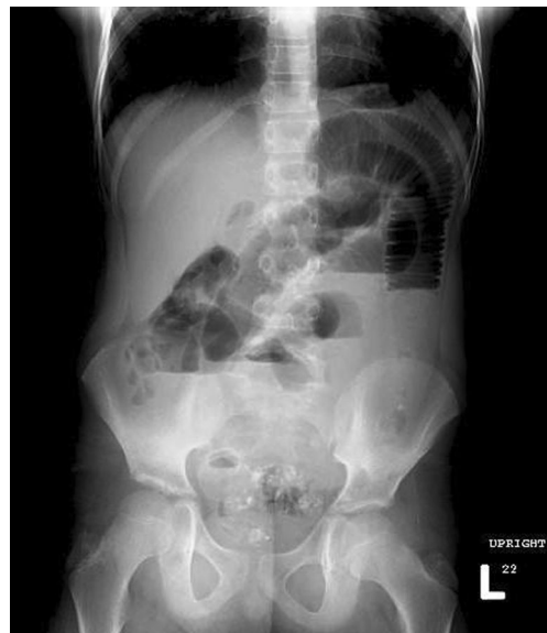
Fig. 1 Upright plain radiograph demonstrating dilated loops of small bowel with differential air fluid levels

A 9-year-old boy presents with non-projectile, bilious vomiting, and mid-abdominal pain. On examination, he was mildly dehydrated. His blood pressure was 130/70 mmHg, pulse of 100 beats/min, and temperature of 37 °C. Abdominal exam failed to reveal any peritoneal signs. Initial laboratory analysis showed leukocytosis to 12,000 cells/ \mu l. An upright plain radiograph of the abdomen (Fig. 1)