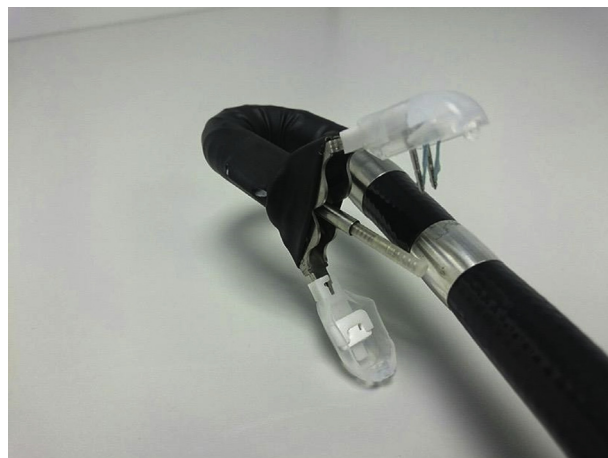
Figure 4. GERDX Device (G-Surg, Seeon, Germany).

Cap-mounted clips. Cap-mounted clips such as OTSC and Padlock have been used for closure of nontunneled exposed EFTR defects, 22 mucosal defects in STER, and also in nonexposed EFTR. 15 For nonexposed EFTR, suction or retraction of the lesion into the cap and subsequent clip firing creates wall duplication and isolation of the lesion, permitting subsequent snare resection above the clip. Available cap and clip sizes restrict the use of this technique to smaller lesions that can be completely retracted into the cap. Series describing the resection of SETs and of recurrent or incompletely resected mucosal neoplasia have been reported. 23,24