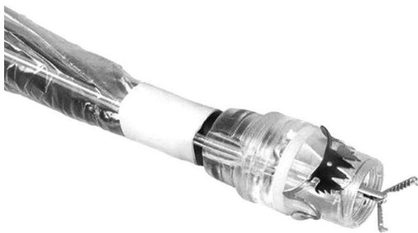
Figure 3. Full-thickness resection device (Ovesco Endoscopy Tubingen, Germany).

This creates an intestinal wall duplication that isolates the target lesion, allowing full-thickness resection “above” the serosal closure. Resection of the isolated tumor above the fixated serosal tissue can be performed with a snare or other ligation device. Video 4 (available online at www.VideoGIE.org ) demonstrates a nonexposed EFTR procedure. 14 Devices that have been used to perform nonexposed EFTR include endoscopic suturing platforms and over-the-scope devices. 15 Use of a cap-mounted clip may aid in hemostasis due to mechanical tamponade. Combined endoscopic and laparoscopic surgical techniques have also been reported. 16-19