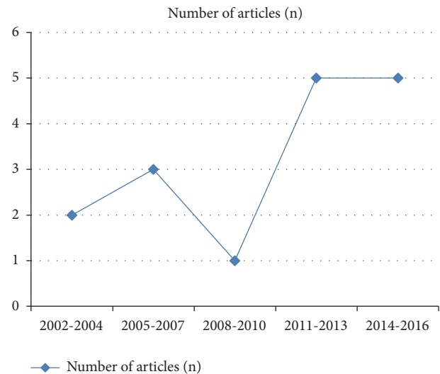
FIGURE 2: Number of published articles by year showing increasing interest in this topic.

The feasibility and safety of wireless video capsule endoscopy in patients with cardiac devices have been called into doubt since its introduction in 2001 by extrapolation to the early negative experiences of cardiac device malfunction with magnetic resonance imaging and electrocautery current. However, the benefits of identifying the source of bleed in patients with cardiac devices are not to be ignored. Especially, patients with cardiac devices mostly have advanced heart disease, dilated cardiomyopathies, and coronary artery disease making of them the candidates par excellence to receive antiplatelets and/or anticoagulants and to be at risk for gastrointestinal bleeding and undergo the ensuing work-up. There has been a growing interest in assessing the safety and feasibility of VCE in this population that was reflected by the increasing number of clinical studies over the recent years. Theoretically, electromagnetic interference between both devices is possible and its impact on either of the devices is yet to be determined [4]. However, interference with the cardiac devices is not an expected event physically, given that the signal magnitude from the capsule recorder is too low to interfere with PPMs/ICDs, in addition to several