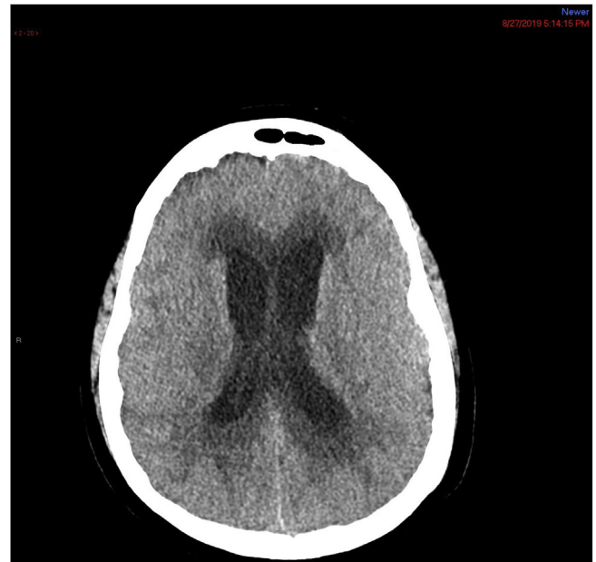
Fig. 2. Non-contrast CT of head with diffuse ventriculomegaly and hydrocephalus of bilateral temporal horns.