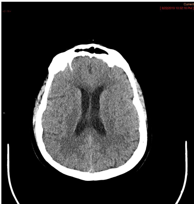
Fig. 1. non-contrast CT of head showing no hydrocephalus with micro vascular ischemic changes.