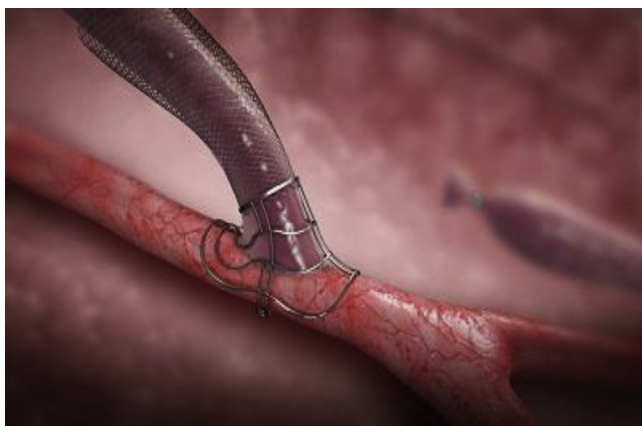
Figure 1. VasQ device (Laminate Medical Technologies, Tel Aviv, Israel). Reprinted with permission from Vascularnews . Laminate receives IDE approval from FDA to initiate study of the VasQ device. Available at: https://vascularnews.com/laminate-receives-ide-approval-fda-initiate-study-vasq-device/ . Accessed January 6, 2020. 18

of AVF (Figure 1). 18 The device externally surrounds and supports the index vein and artery near and around the anastomosis, acting as a scaffolding to preserve the ideal angle of anastomosis. It is purported to reduce turbulent flow and prevent neointimal hyperplasia. 19