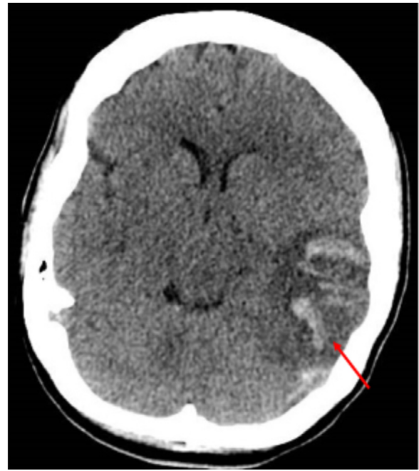
Fig. 1. Non-contrast head CT demonstrating left temporoparietal hemorrhagic venous infarct with edema and mass effect causing 5 mm rightward shift, red arrow pointing to increased attenuation and venous thrombosis in distal left transverse and sigmoid sinus

MRI brain showed hyperintense DWI signal of the left temporoparietal hemorrhagic infarct with mass effect and effacement of the left lateral and third ventricle with 4mm