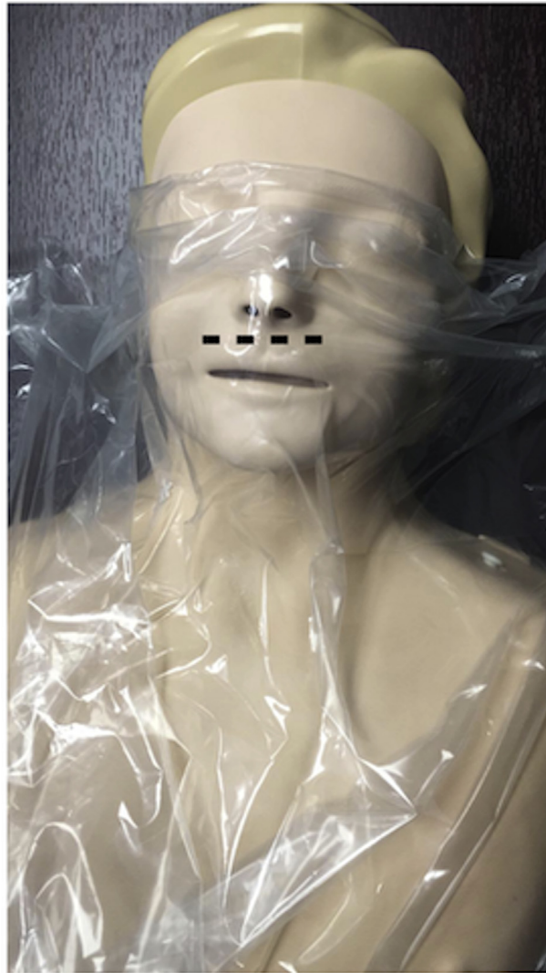
Figure 2. For endonasal endoscopic cases in which the risk of aerosolization of coronavirus disease 2019 (COVID-19) may be extremely

high, the prevention drape should be modified with a small aperture ( dotted line ) to allow instruments to pass into and out of the nares.