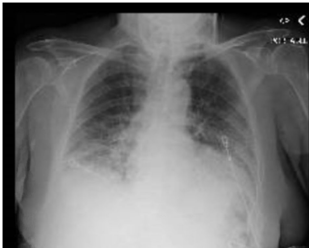
Figure 1. Chest radiograph on admission showing basilar opacities, blunting of the costophrenic angles, and reticular markings.

Abbreviations: BUN, blood urea nitrogen; eGFR, estimated glomerular filtration rate; RBC, red blood cell; WBC, white blood cell.