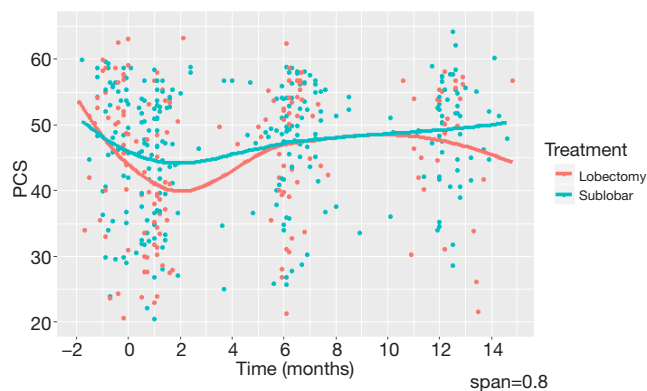
Figure 1 Scatter plot of PCS scores with non-parametrically smoothed LOWESS curves by surgical group using 80% of the data closest to each time point (span =0.8). PCS, physical component summary.

QoL scores. Differences in the missing data patterns were assessed between surgical groups (27).