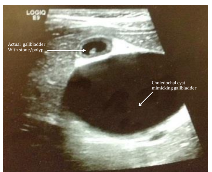
Figure 2. Follow-up radiologic ultrasound showing presence of mild intrahepatic biliary ductal dilatation as well as a large cystic mass with internal echoes and debris confirmed as a choledochal cyst. The gallbladder with multiple gallbladder stones or polyps is also pictured above.

There is no definite explanation for the pathogenesis